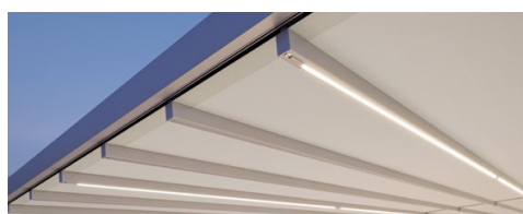
LED lighting in the cover support profiles and in the cross-beam