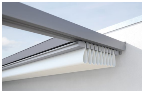
markilux pergola stretch: Cover retracted