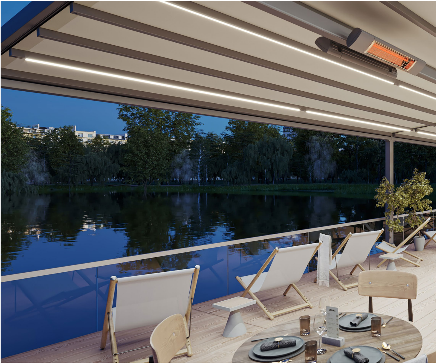
markilux pergola stretch