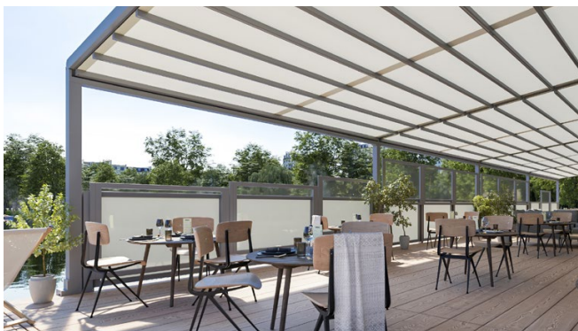
markilux format as lateral wind protection and privacy screen