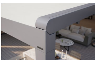
An integrated gutter reliably ensures water evacuation

The option to fit atmosphere-creating lighting, heaters and a broad choice of fabric patterns, the markilux pergola stretch can be personalised and made to provide more comfort in manifold ways. The perfect ambience in which to spend cosy hours together or with family, friends or guests. And it invariably gives a great performance, regardless.