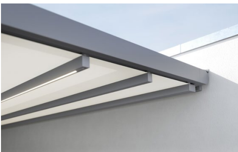
markilux pergola stretch: Cover extended