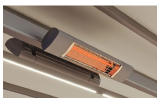
A heater fitted to a cross-beam